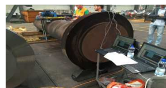
Fig. 10. Measuring test with several data loggers including the subsequent protocol - October 2016 (hpw)