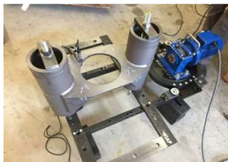
Fig. 21. Multiple clamping jig, customer part from Thommen in Safenwil - October 2017 (hpw)