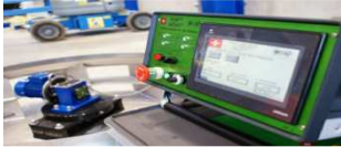
Fig. 26. WIAP MEMV control device with the V20 exciter in the background, Tampere, FI - August 2017 (jw)