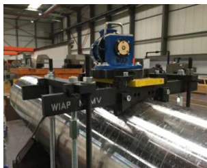
Fig. 4. Treatment process: parts - April 2017 (hpw)