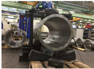
Fig. 7. Duplex pipe test - August 2017 (hpw)