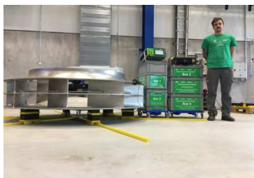
Fig. 1. Jim Peter Widmer in Tampere, Finland, in front of a "vibration stress relief on metal" (MEMV) installation from WIAP AG - August 2017 (hpw - Hans-Peter Widmer)