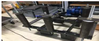
Fig. 20. Six cylindrical pipes on one multiple clamping jig, Berlin - August 2017 (hpw)