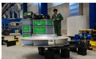
Fig. 22. Impellers on one multiple clamping jig in Tampere, FI - August 2017 (jw)