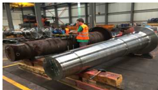
Fig. 3. Jim Peter Widmer in front of an annealed roll and an unannealed roll - October 2016 (hpw)