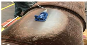
Fig. 9. Measuring test with one data logger: support annealed - October 2016 (hpw)