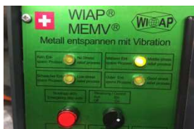
Fig. 23. WIAP MEMV E control device, Safenwil (hpw)