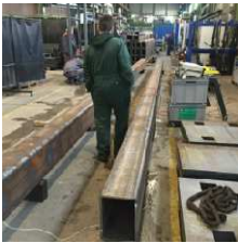
Fig. 13. Flame straightening: MEMV vibration test with the elaboration of the protocol (hpw)