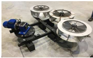
Fig. 19. Three impellers with a diameter of 800 mm on one multiple clamping jig, Tampere, FI - August 2017 (hpw)