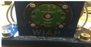
Fig. 14. New V20 exciter with various setting possibilities in % for different eccentric stages - October 2017 (hpw)