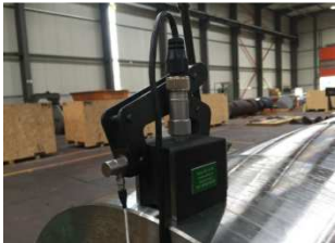
Fig. 28. MEMV measuring probes - July 2017 (jw)