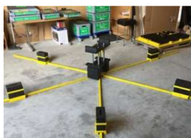
Fig. 17. Star rubber floor holder with an axial exciter fastening jig - August 2017 (hpw)