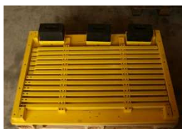
Fig. 16. Star floor holder for rubber pads - August 2017