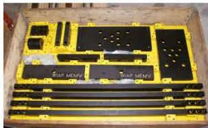
Fig. 15. Clamping jig in the axial direction for one impeller - August 2017 (hpw)