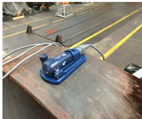
Fig. 8. Measuring test with the aid of one data logger - October 2016 (hpw)