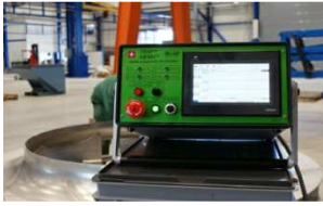
Fig. 25. WIAP MEMV 20E control device, Tampere, FI (jw)