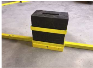
Fig. 18. Floor rubber holder for a multiple star floor holder - August 2017 (hpw)