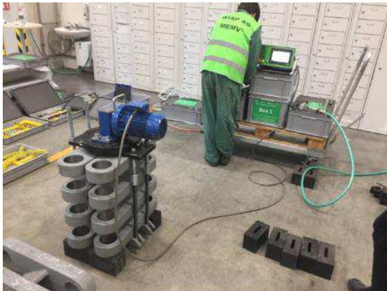
Picture: WM_865_40. Artificially aging of castings.

Artificially castings aging. The first 2 parts were pre-processed; two parts raw, without preprocessing.