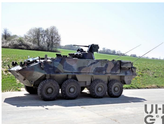
Figure 1: From internet 02_2019 (Photo from Internet)

A defense contractor manufactures vehicles for NATO. In delivering works all vehicles to be removed, everything was ok, all right: