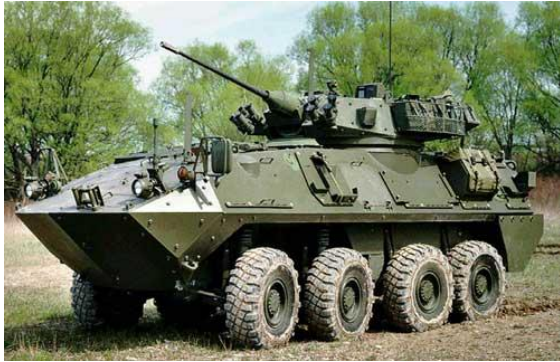
Figure 4: devices with cracks arrived abroad. treated before transportation MEMV prevents such cracks. Such topics are hushed.