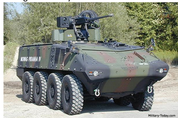
Figure 2: From internet 02_2019

then transported through Europe to Ireland, there was half of the vehicles long cracks in the front and side walls. The WIAP AG negotiated with the manufacturer and the end user, NATO decision people it was said, it could be welded on site and repaired, relaxed with a WIAP MEMV system. There were then treated all vehicles abroad and in production organization WIAP MEMV. Of new cracks was not spoken. Special feature: Thanks to the WIAP MEMV process could be carried out on site the whole process. It has just the electronics of the gun turret to produce no damage caused by vibrations.