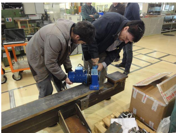
Figure 5: Test in the largest International Research Institute in Geneva