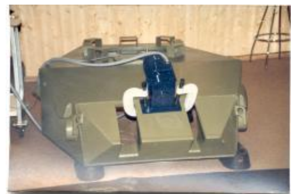
Figure 3: Vibration relaxation from previous years (WIAP photo of FAWEM fair on the stand WIAP)