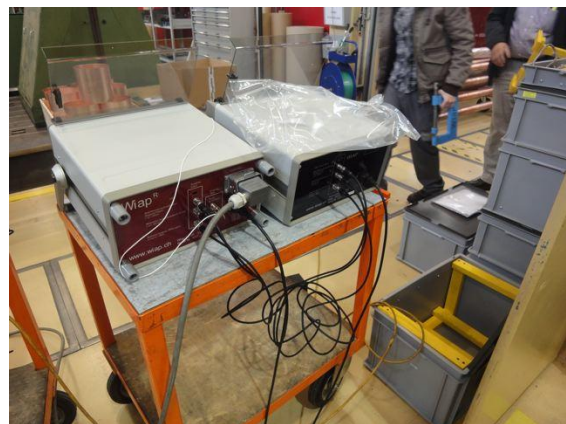
Figure 7: WIAP conditioning, with log unit

The WIAP AG was commissioned to make a test in the largest international research institute in Switzerland, in Geneva. The Research Institute bought a carrier from Bulgaria, they were highly accurate. The buyer himself sent engineers to examine the manufacturing plant to ensure quality. It was all ok. In hundredths exactly was taken. Delivery by truck from Bulgaria to Geneva, where the inspection on entry into the workpieces were in tenths of a millimeter range warped after transport. At the time, WIAP AG made measurements at the Swiss end customers. The components should have been treated by the pre-processing prior to finishing WIAP MEMV, then this delay had not occurred.